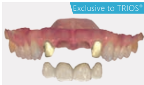
Temporary crowns and virtual diagnostic wax-ups