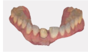
Veneers, inlays and onlays