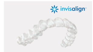
Invisalign® Expected availability Q4 2016

Offer more treatments with add-on software modules