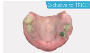
Removable partial dentures