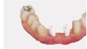
Abutments, implant bridges and bars