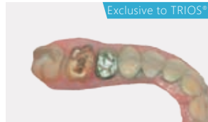
Post and core