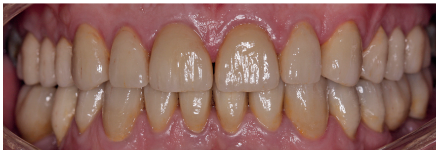
After: after upper-jaw reconstruction (bite – frontal view).