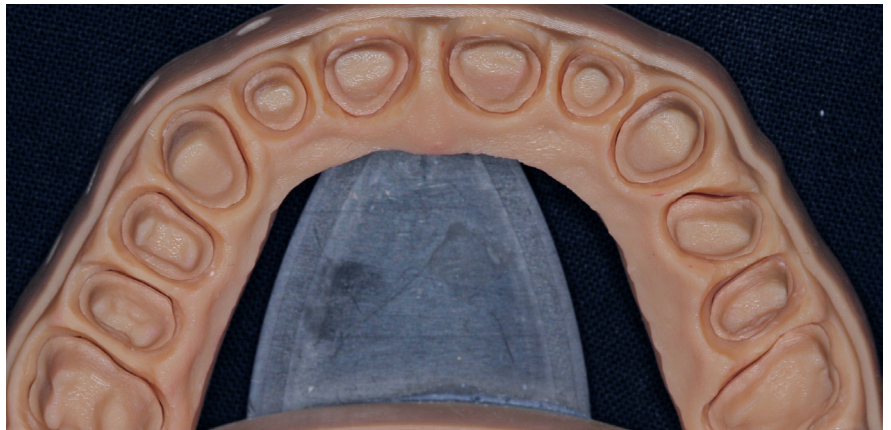
Digital upper-jaw model.