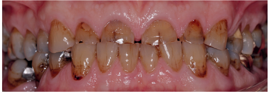
Before – full-jaw reconstruction (bite - frontal view).