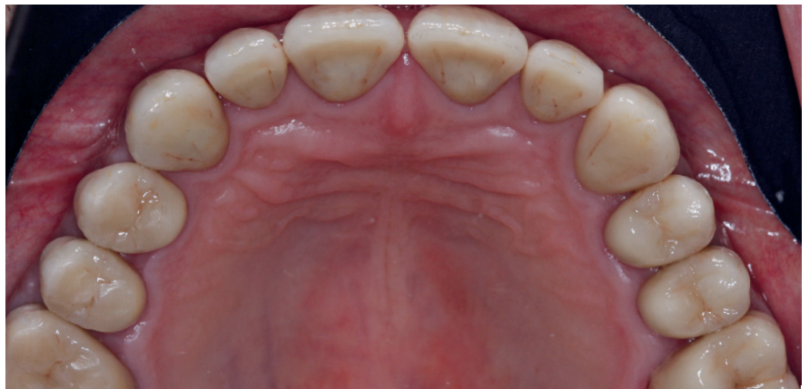
After: Full-jaw reconstruction (upper-jaw occlusal view).