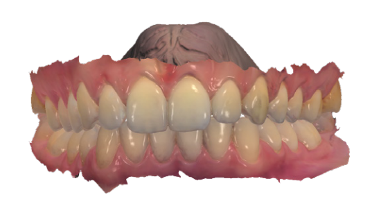
Fig. 11 Fig. 12

Our control sessions were every two weeks. Contact points and teeth movements were controlled as well as patient's oral hygiene.