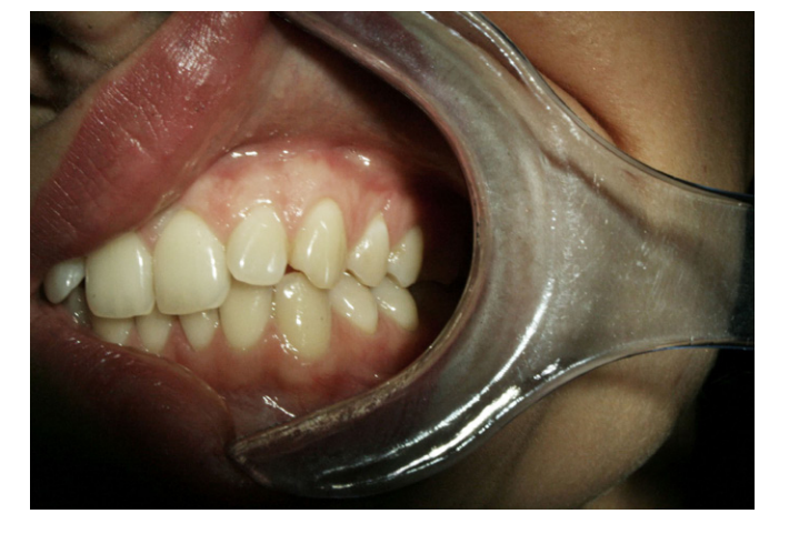
Fig. 3 Fig. 6